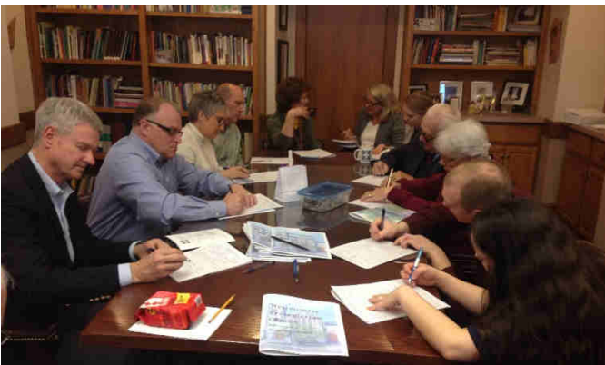
New members complete forms in the Pastor's Study. On Sunday, March 5 they will be received by the Session at 9:30 a.m. in the Library and recognized during the 10:00 a.m. service. We welcome 15 new members.