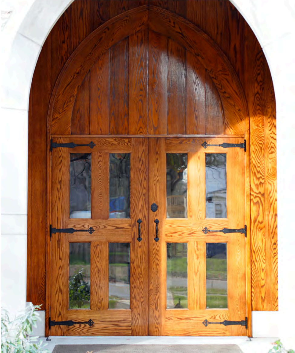
Westminster Presbyterian Church Springfield, Illinois