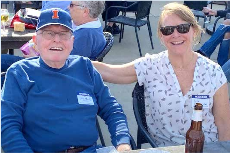
Twenty-one members enjoyed a beautiful autumn afternoon at a fellowship event hosted by the Board of Deacons.