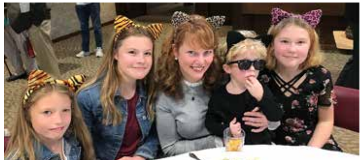
Eighty-five members and friends gathered for Harvest Fest. Along with a delicious meal, children enjoyed crafts, face-painting, storytelling, and a Halloween maze in the Youth Room.