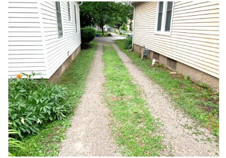
Grant to pave shared driveway of 506 and 508 S. Glenwood was awarded.